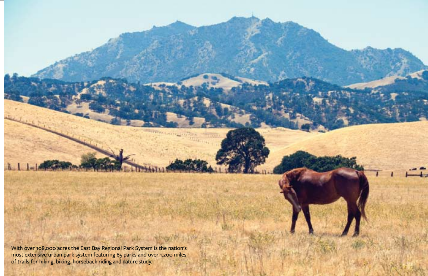
With over 108,000 acres the East Bay Regional Park System is the nation's most extensive urban park system featuring 65 parks and over 1,200 miles of trails for hiking, biking, horseback riding and nature study.

For growing families, the East Bay offers a wide array of communities with excellent public schools. K-12 education in the East Bay achieves some of the highest SAT and Academic Performance Index (API) scores in the state. According to California Department of Education 2010 data, more than 40% of the East Bay's 625 K-12 schools exceeded the state's top performance target with 117 of them scoring in the top decile of the API. (See Opportunities section for more information.)